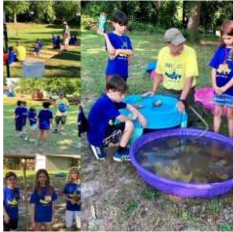
Cub Scouts Twilight Camp was held at Seven Oaks Presbyterian Church June 17-21.

NEWS FROM YOUR SESSION Jim Wilhide, Clerk of Session