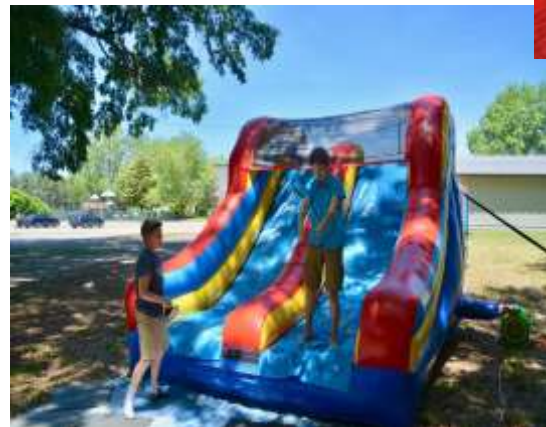
The kids enjoyed the inflatables at our Block Party!