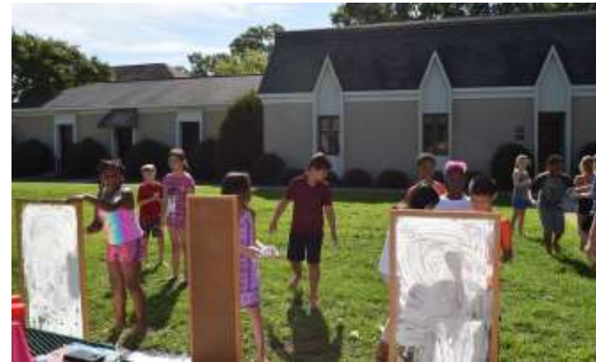
VBS 2019 - Loads of fun activities during our week!

Our church has been very busy this season. We had a Block Party and invited young and old alike! We installed Elders and recognized confirmands. We celebrated Pentecost. We have worked hard, studied hard, played hard and enjoyed fellowship with each other. It's an exciting time in the life of our church!