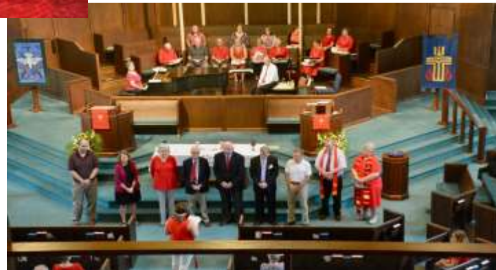
Installation/ordination of our Elders.