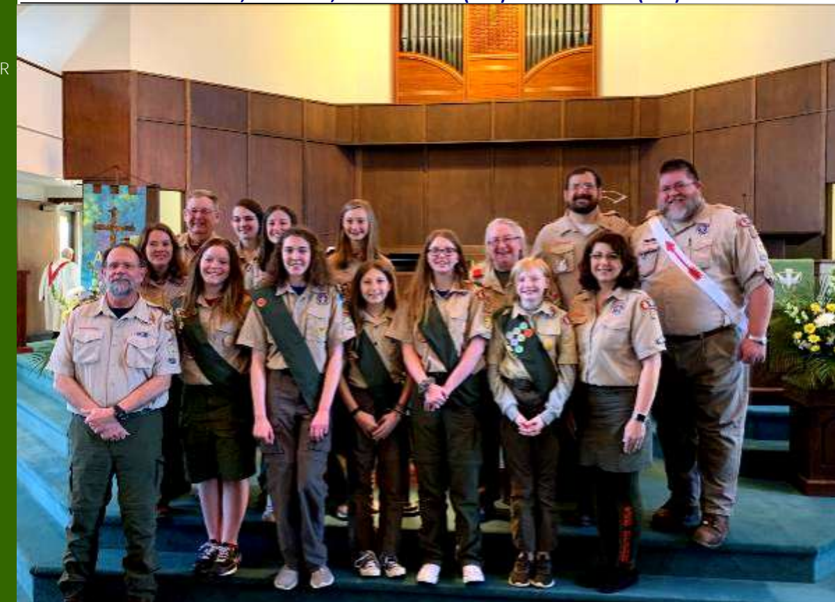
Celebrating Scout Sunday on February 9