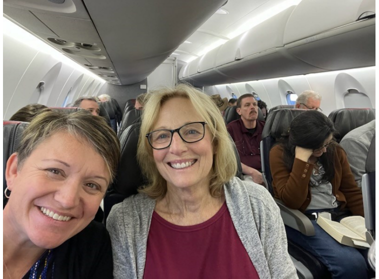
On board and waiting for take off to Miami, then on to Cuba!!!