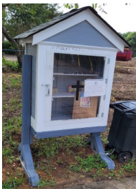
Missions & PW fed SOES Jan 2

Non-perishable food donations for the Blessing Box can be placed inside the box at any time. If you place items, please be sure they are securely wrapped as ants get into the food. If the box is full, please bring your items to the office. SOPC thanks KJ's Grocery Store for donations they provide for our Blessing Box. When you shop at the KJ's across from the church, you can purchase a bag of groceries for $5.99 to add to the collection.