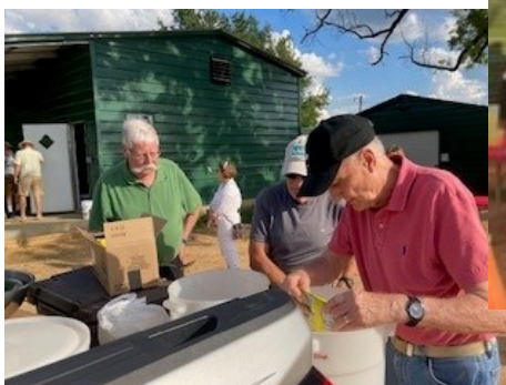
Mission Ministry and other members from SOPC took a meal to the migrant workers in Lexington County on July 11.