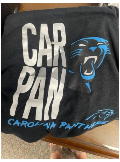
Carolina Panthers Jacket

Below are items that were found in the Fellowship Hall after VBS. If you are the owner you can pick them up in the church office.